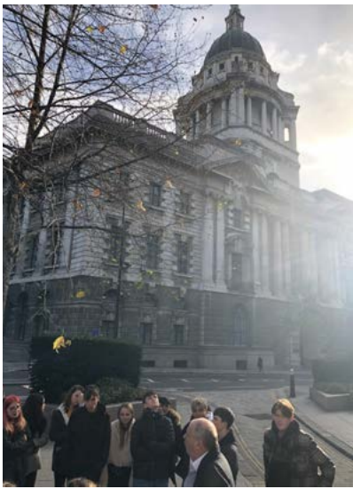
Law reporter enthralled students with tales of murder outside The Old Bailey