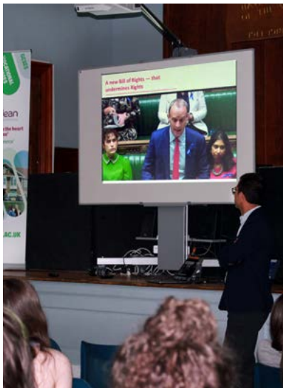
Goldsmiths Law Convention - July 2022