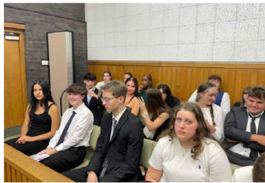
Mock Trial at Brighton Magistrates Court - June 2022