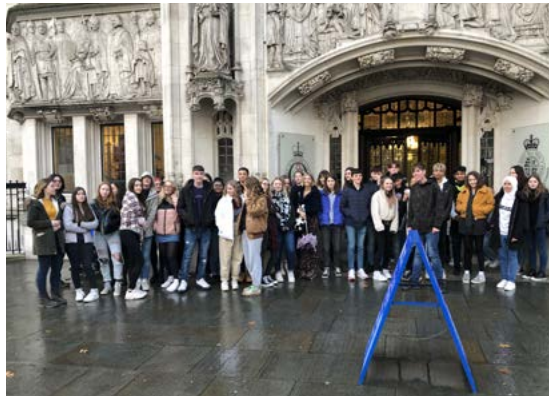
Visit to the Supreme Court - Dec 2019