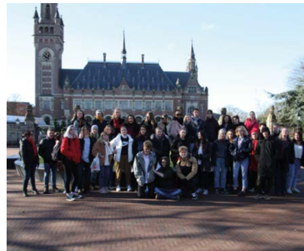
Visiting The Peace Palace in The Hague

You can go to University as your BTEC will count as UCAS points. Our current students are applying for Business and Management, International Marketing, Human Resources, Law, Computing and Travel and Tourism. You could also consider employment in a law firm, working for the courts, banking, insurance, Local Government and journalism.